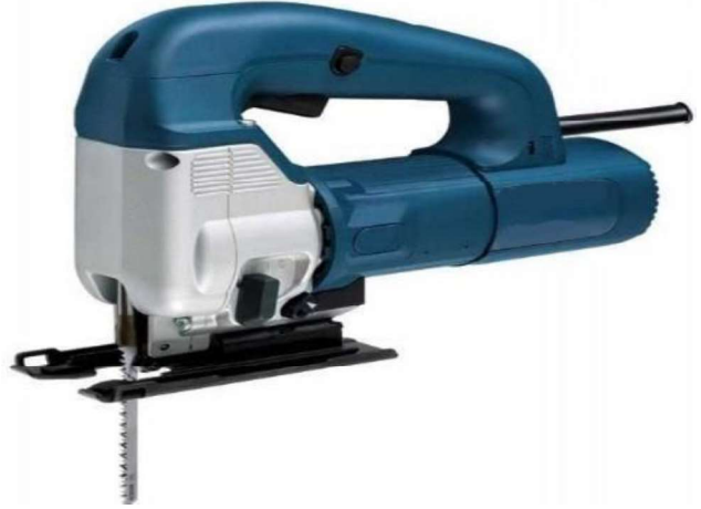
Item 2: Jig Saw (Corded)