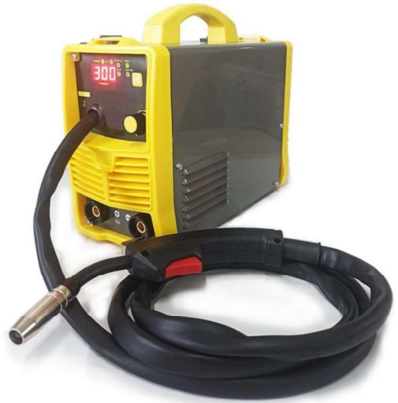
Item 6: Portable Welding Machine