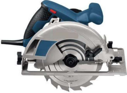
Item 1: Circular Saw (Corded)