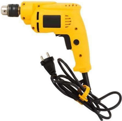
Item 3: Rotary Drill (Corded)