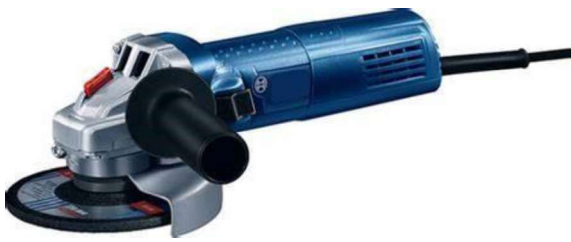
Item 5: Angle Grinder (Corded)