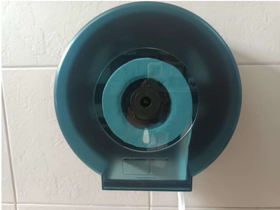
Item 1: Jumbo Toilet Roll Dispenser