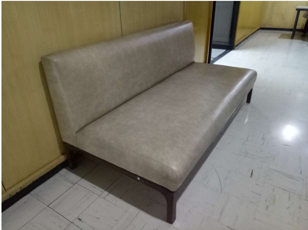
3-Seater Sofa at HRMG Reception Area