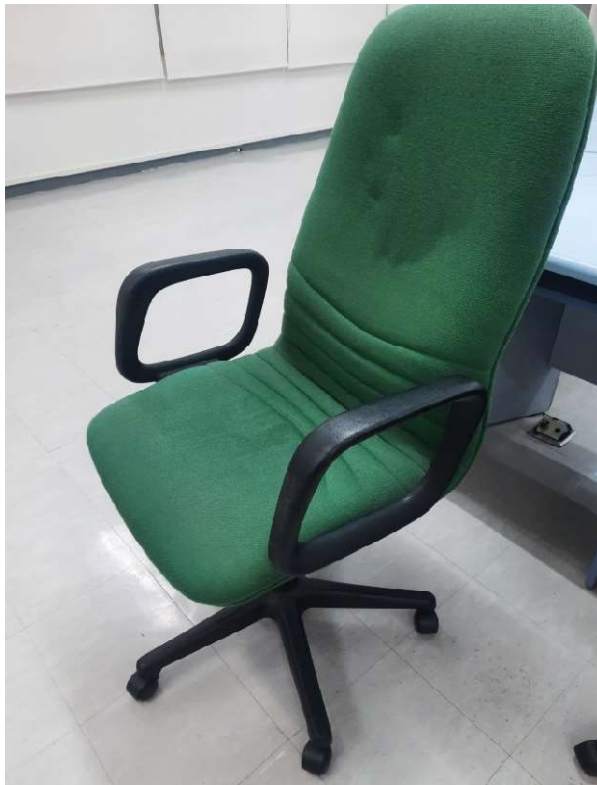
Conference Chair at BAC Bidding Room