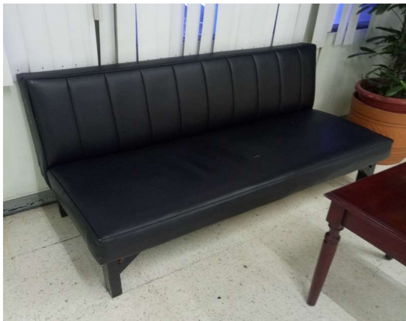
2-Seater Sofa at PMD