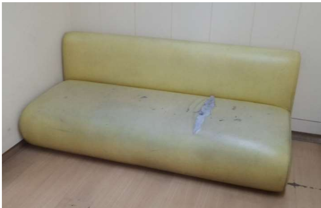
3-Seater Sofa at Training Room