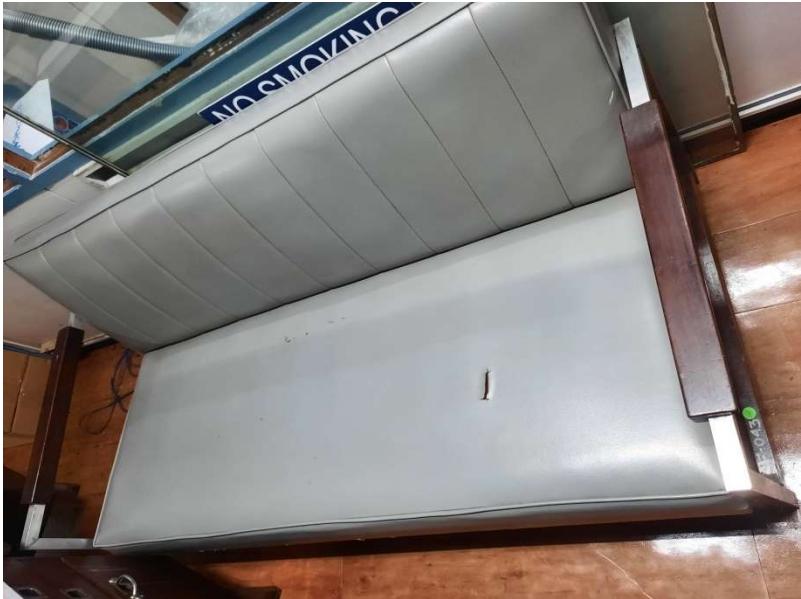
3-Seater Sofa at EFMD