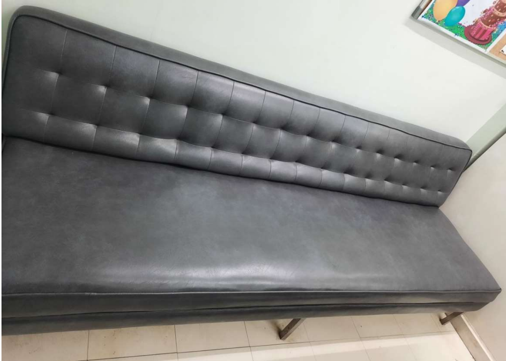
3-Seater Sofa at PPMD