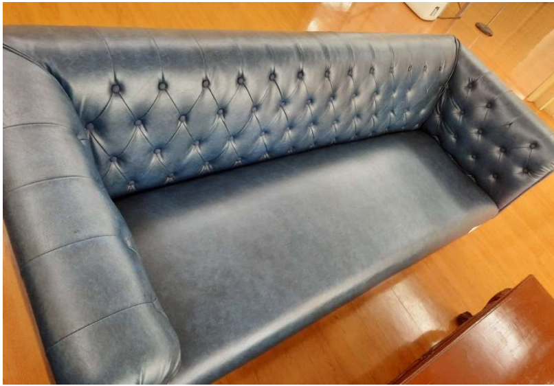
3-Seater Sofa at Executive Lounge