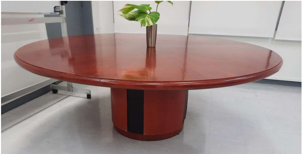
Circular Meeting Table at BAC Bidding Room