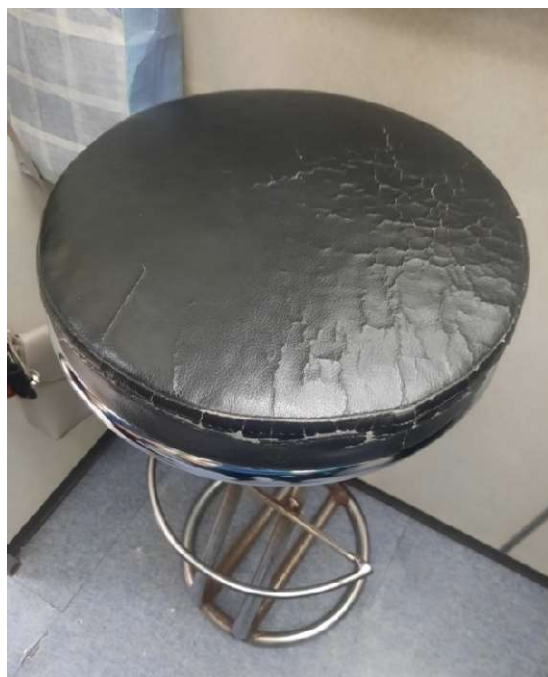
Operator's Chair at Elevator Cars