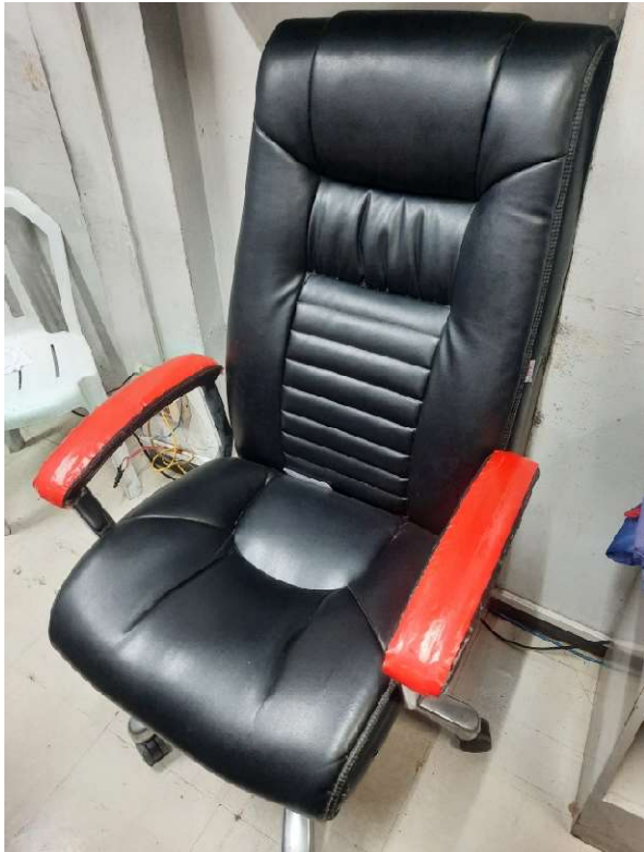
Executive Chair at EFMD