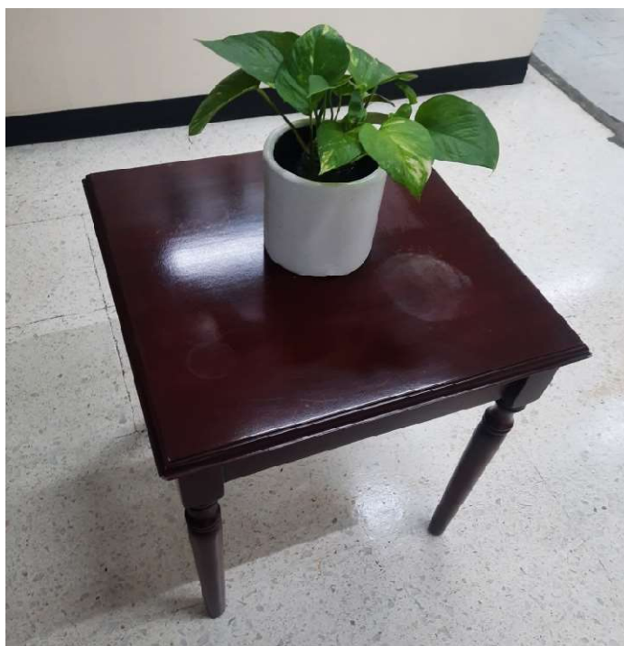
Coffee Table at PMD