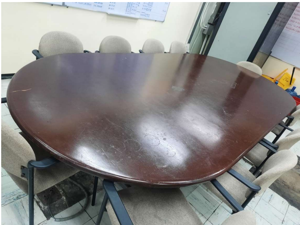
Conference Table at BACSD