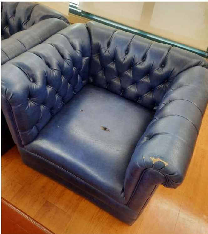
1-Seater Sofa at Executive Lounge