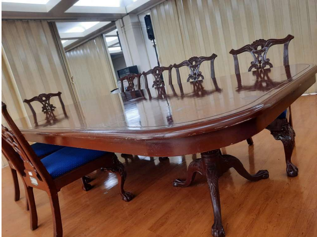
Conference Table at Executive Lounge