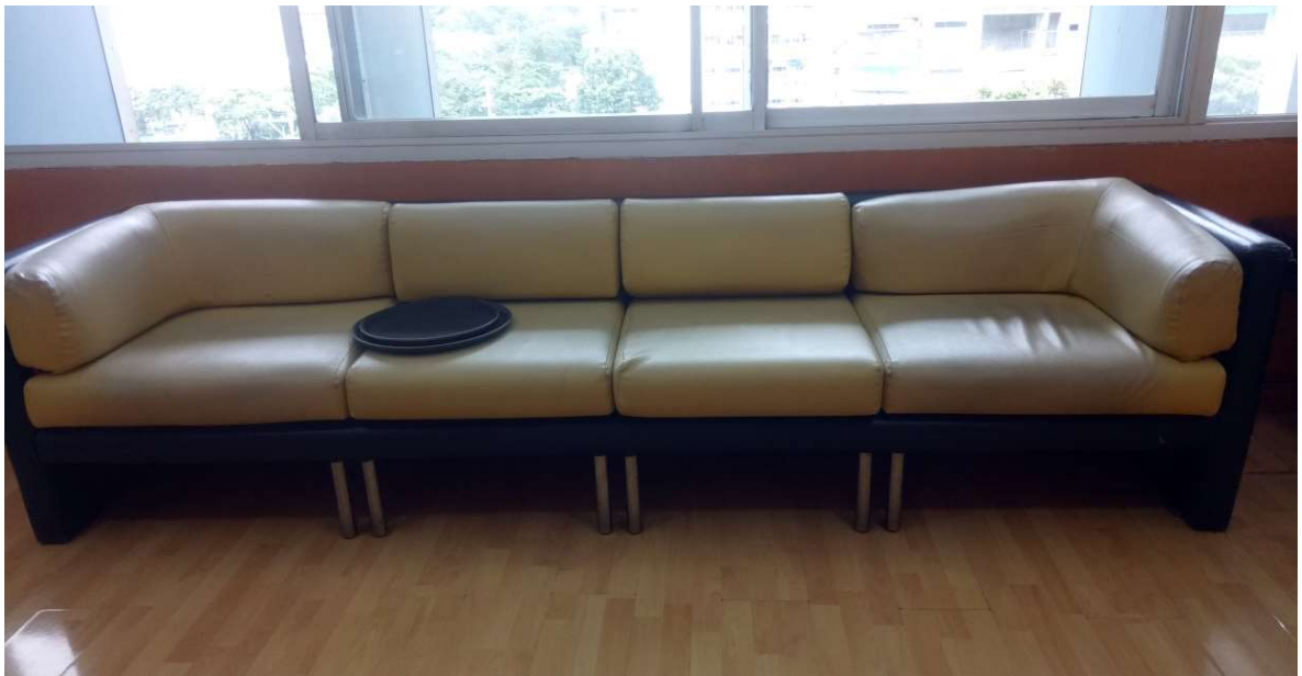
4-Seater Sofa at OPCEO Hallway