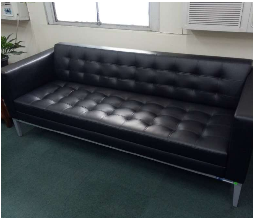
3-Seater Sofa at OEVP-BOS