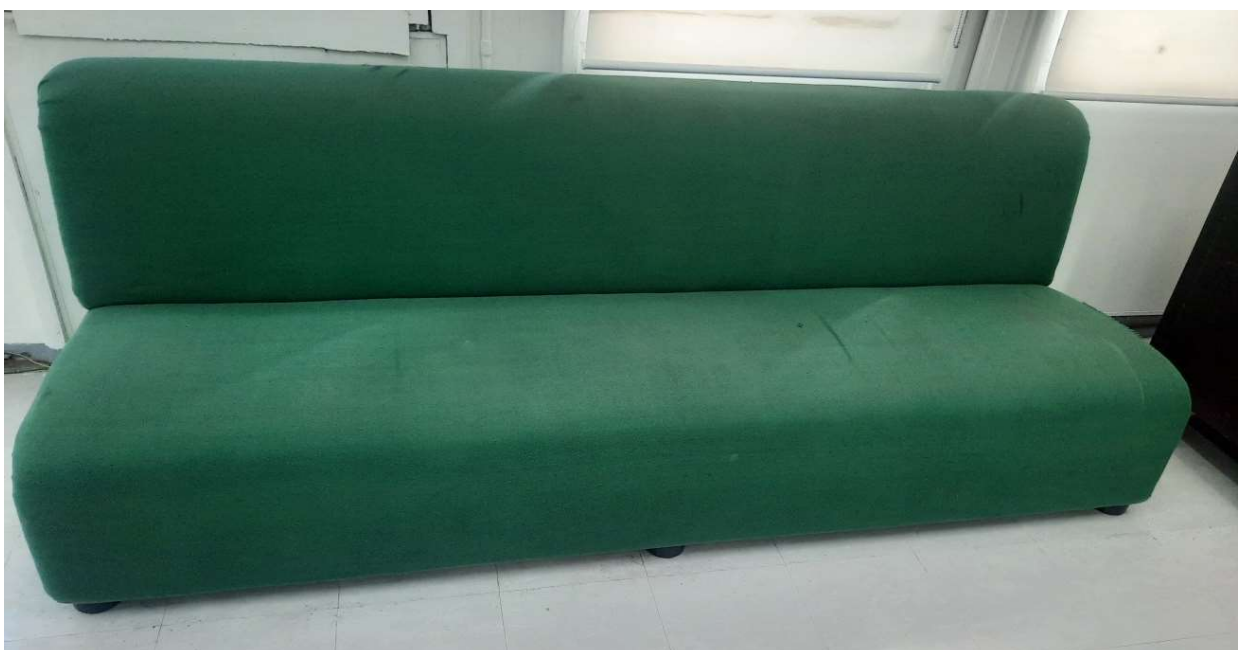
3-Seater Sofa at BAC Bidding Room