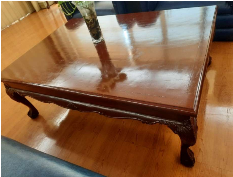
Center Table at Executive Lounge