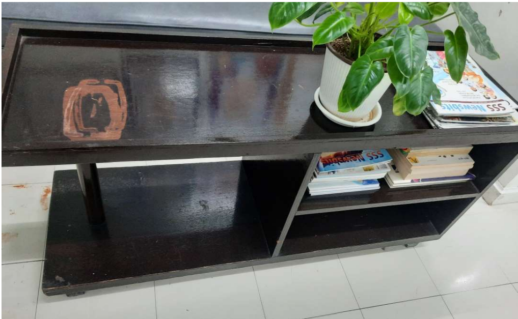
Center Table at PPMD