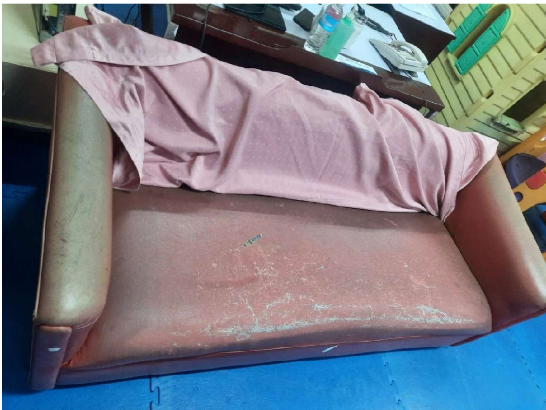
3-Seater Sofa at Day Care Center