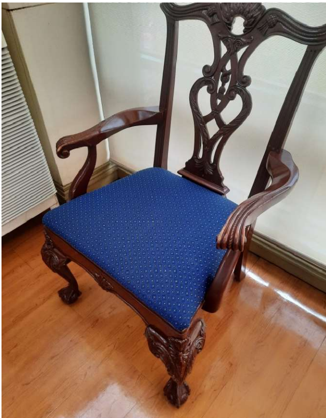
Conference Chair at Executive Lounge