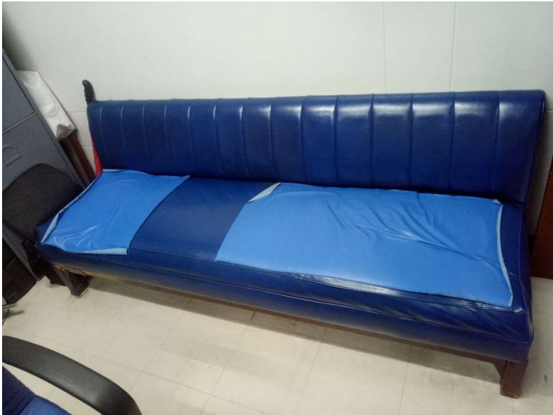
3-Seater Sofa at NCD