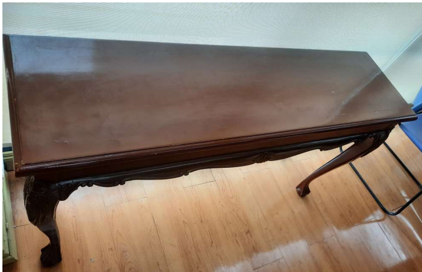
Side Table at Executive Lounge