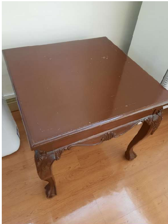
Coffee Table at Executive Lounge