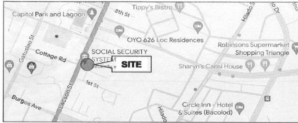
1 REF-01 SCALE NTS VICINITY MAP