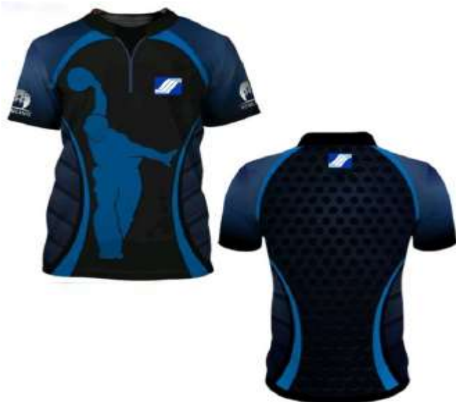
Intercolor Tenpin Bowling