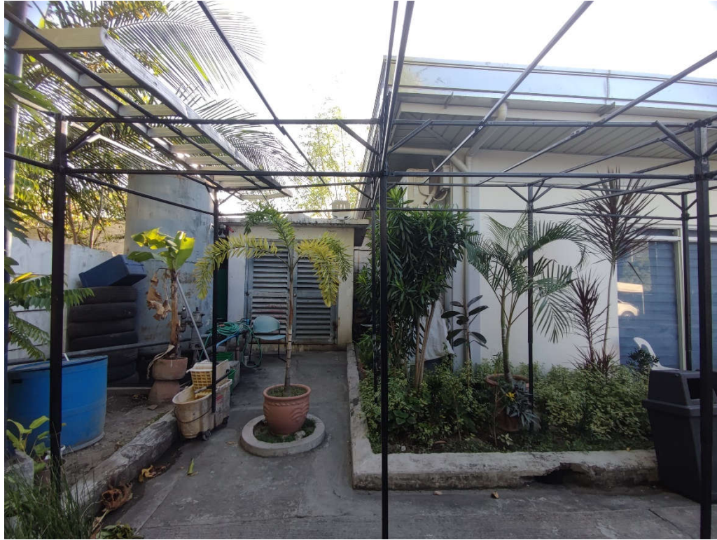
CISTERN TANK AREA