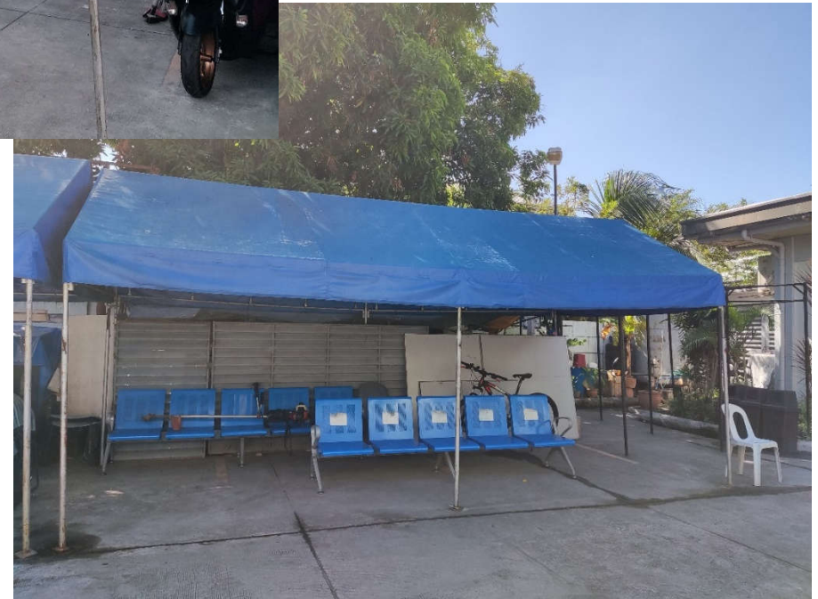
PERIMETER LEFT SIDE