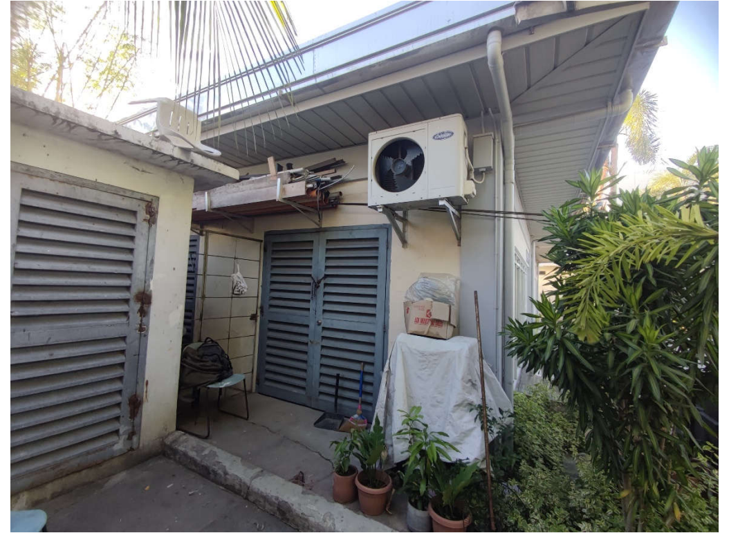
MEDICAL EVALUATION CENTER LEFT SIDE