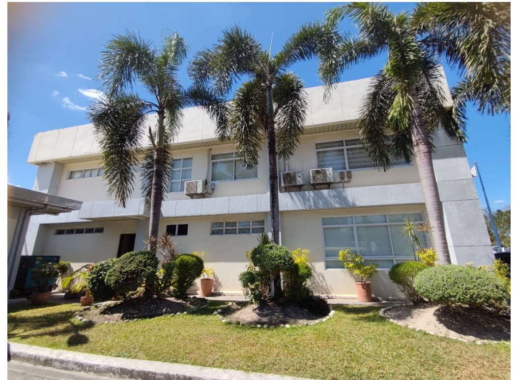
BUILDING LEFT SIDE