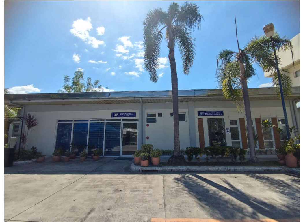
MEDICAL EVALUATION CENTER & LEGAL OFFICE