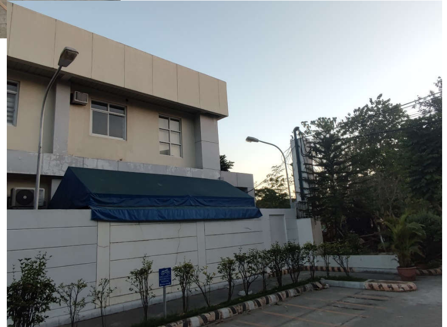
PERIMETER RIGHT SIDE