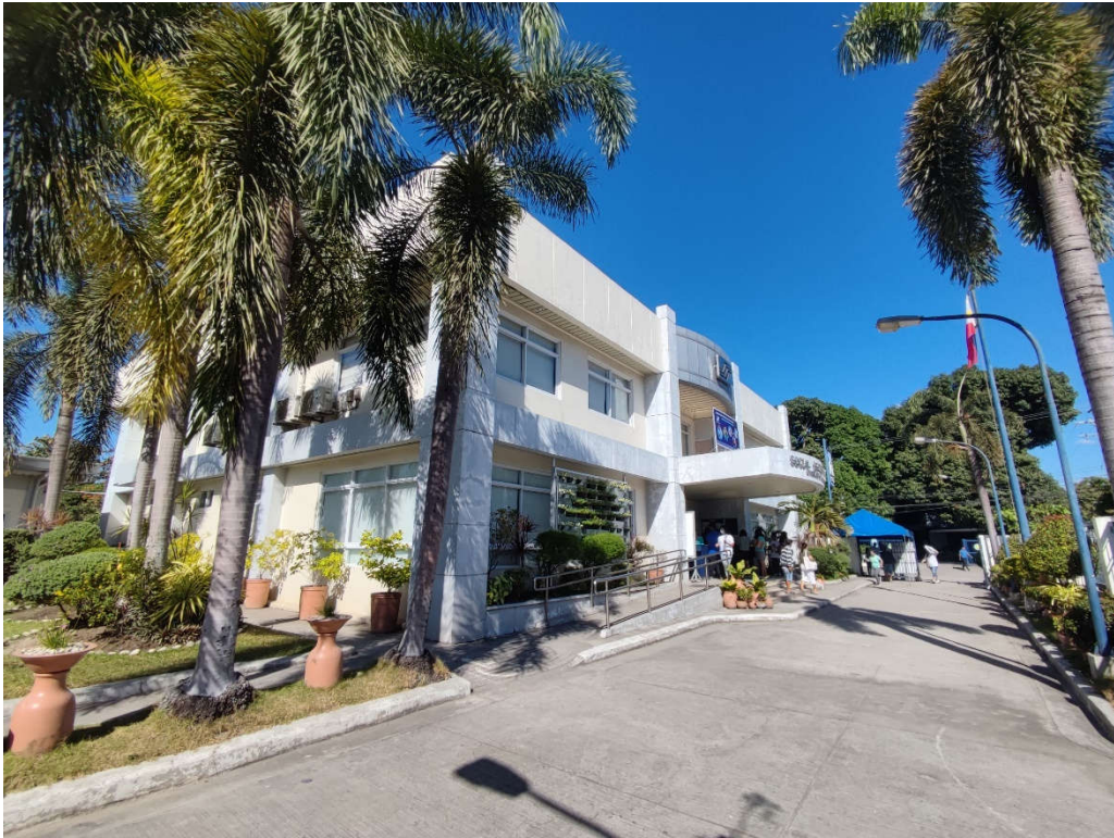
BUILDING FACADE & LEFT SIDE