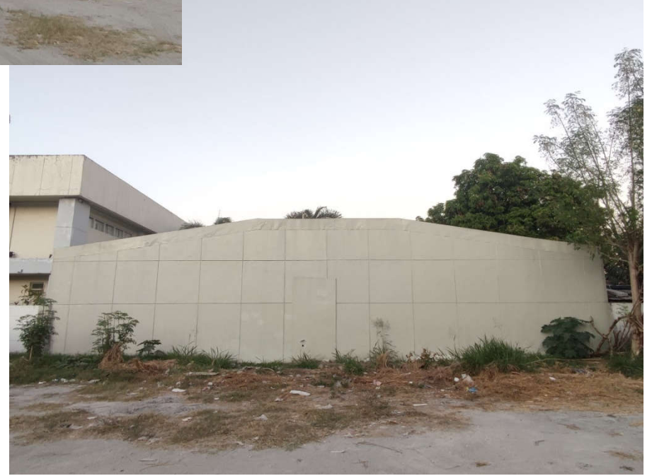
PERIMETER REAR SIDE