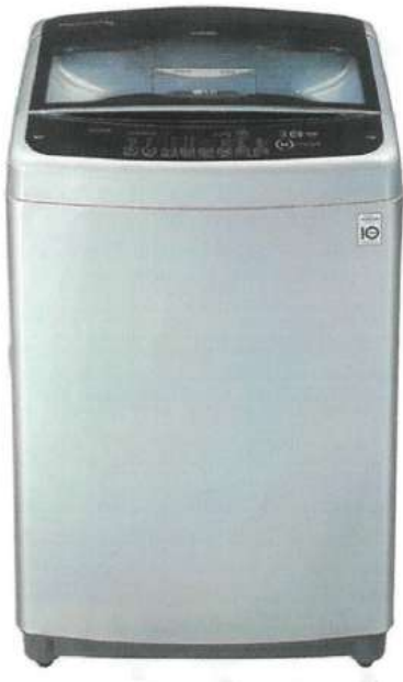
TOP LOAD AUTOMATIC WASHING MACHINE