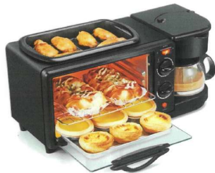
MULTIFUNCTION BREAKFAST MAKER