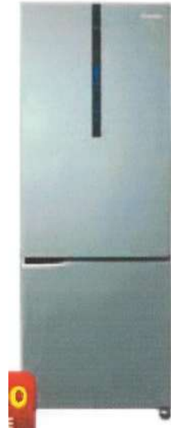
TWO DOOR REFRIGERATOR (INVERTER)