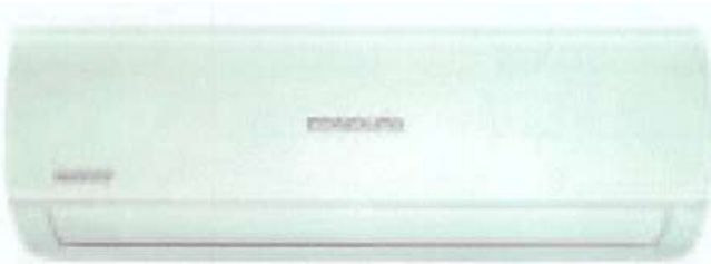
SPLIT TYPE AIRCON INVERTER (1.0HP)