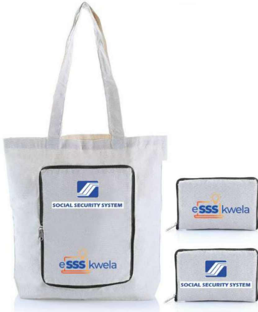
Canvass Tote Bag Sample Item