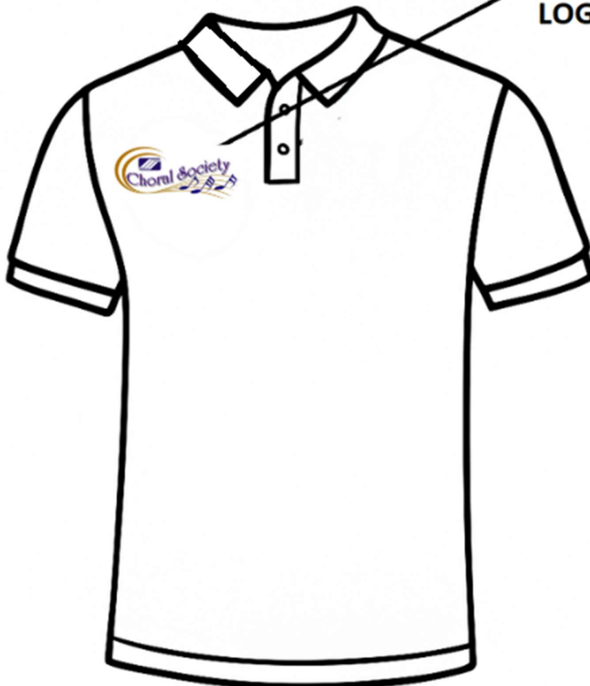
SSS CHORALE LOGO